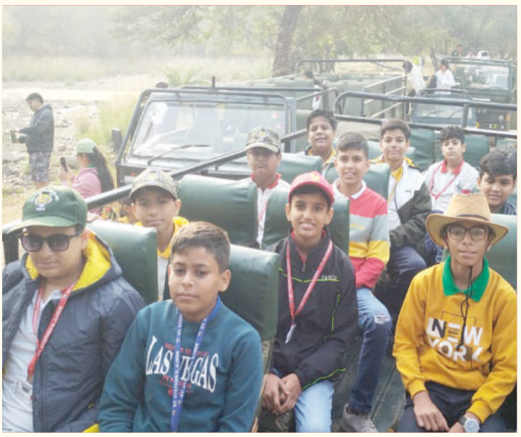
Blending education with adventure—unveiling the Seven Wonders & Ranthambore's hidden gems