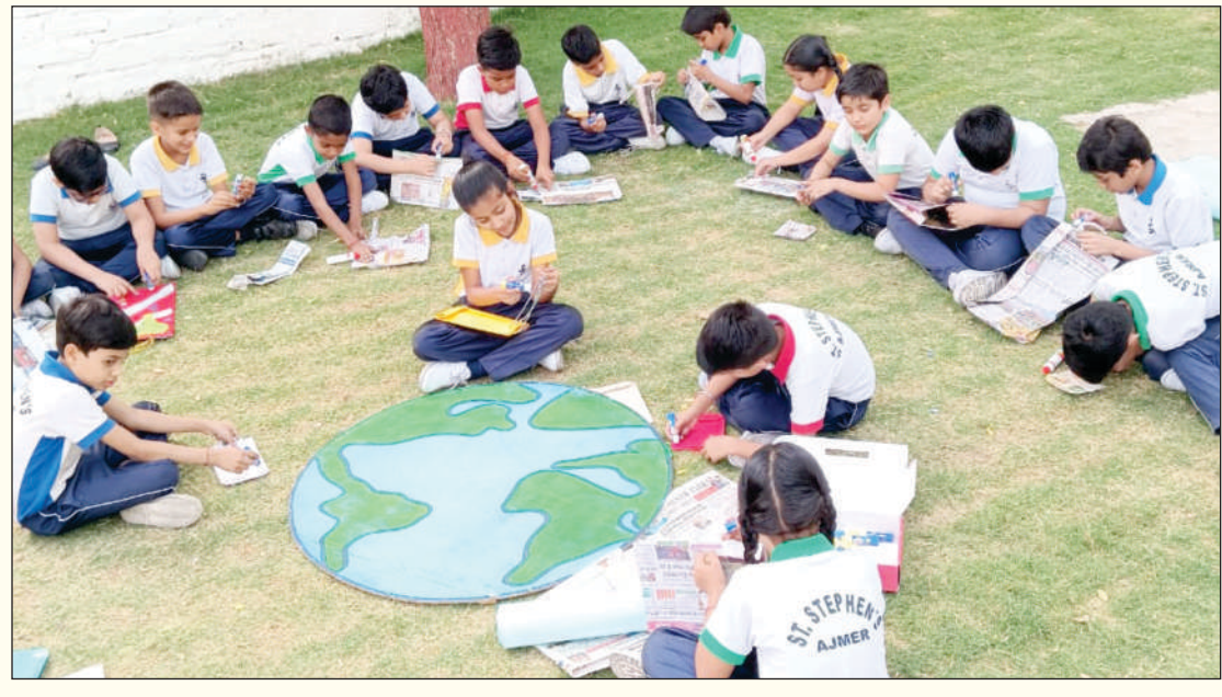
Designing a paper Bag