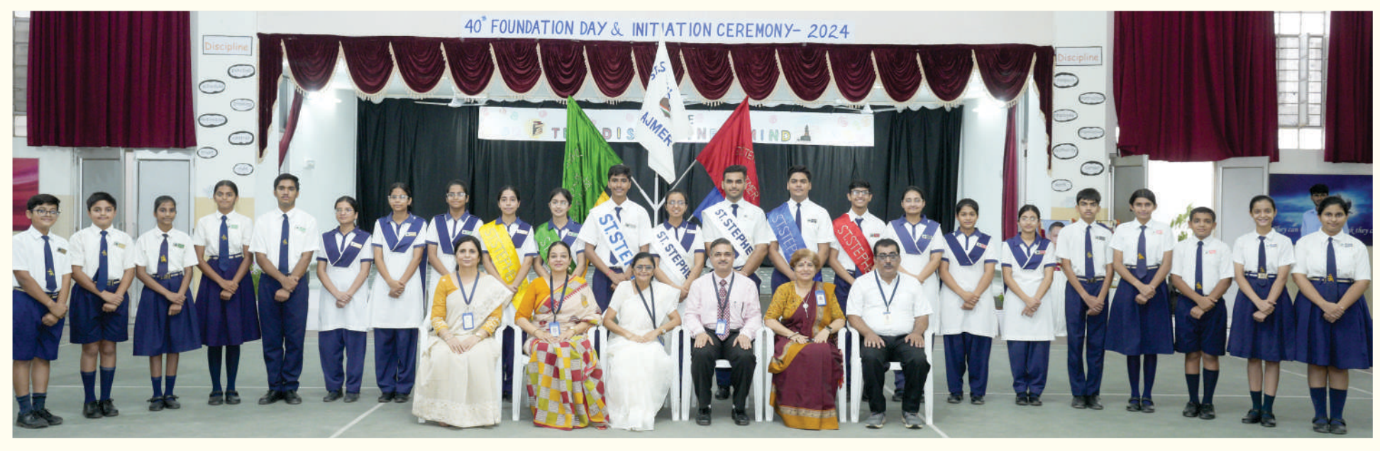
Foundation Day & Initiation Ceremony of Office-Bearers