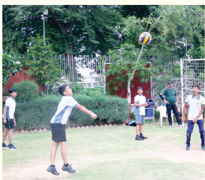
Inter-House Volleyball Tournament