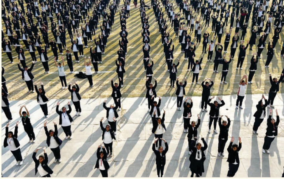
Surya Namaskar: Celebration of 'Surya Saptami'