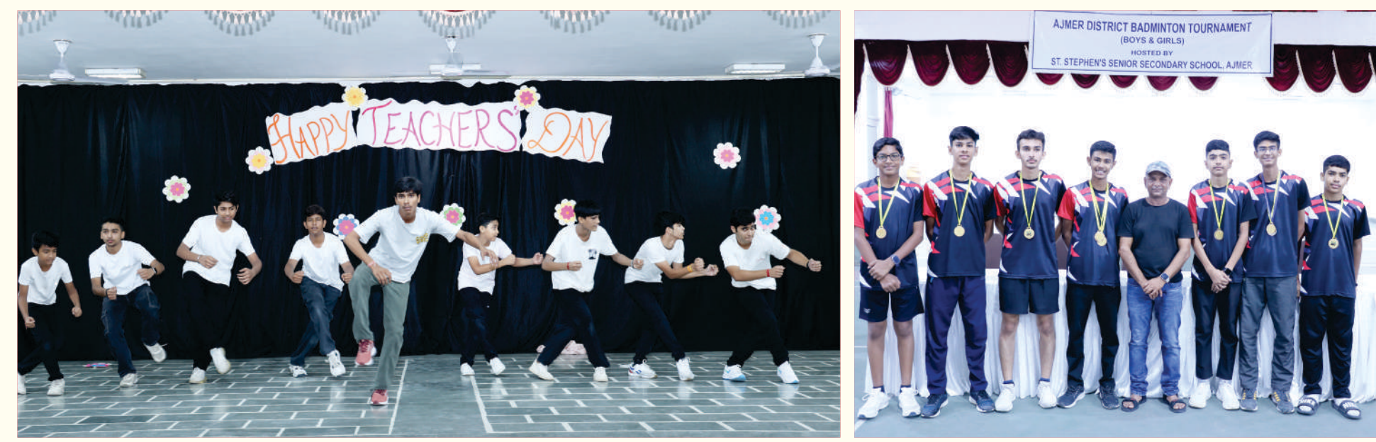
Teachers' Day Celebration