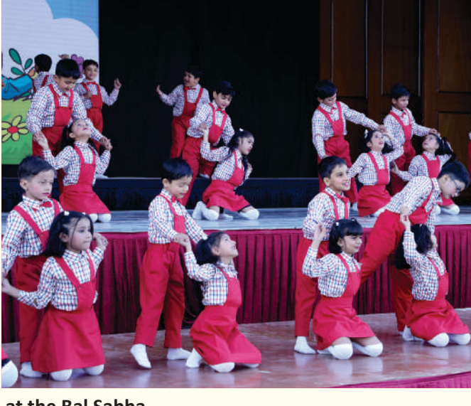
Students perform at the Bal Sabha