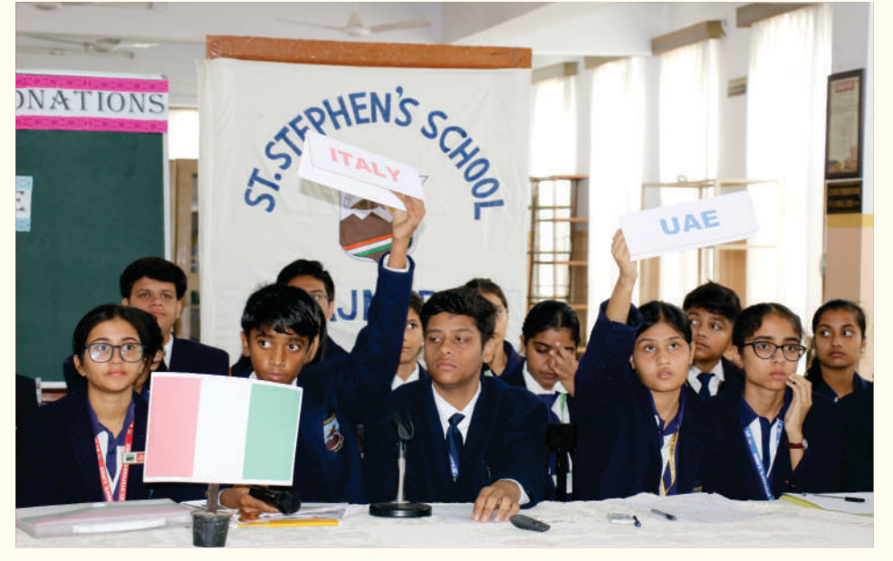
TIME Project Global Video Conference