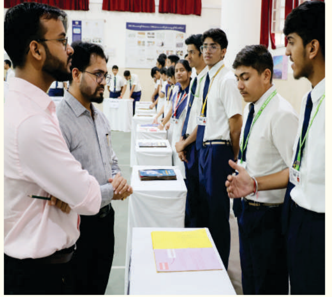
Commerce Chronicles: Drafting Business Magazines