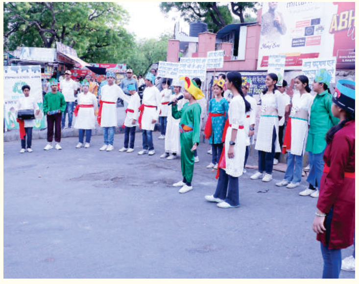
Nukkad Naatak on 'Air Pollution'