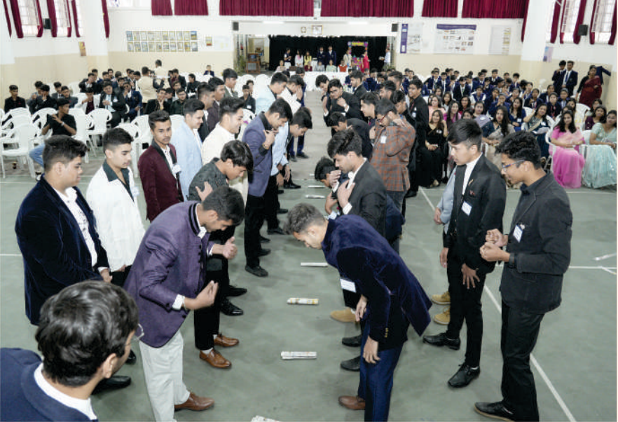
End of an era, beginning of a lifetime - Farewell Grade XII