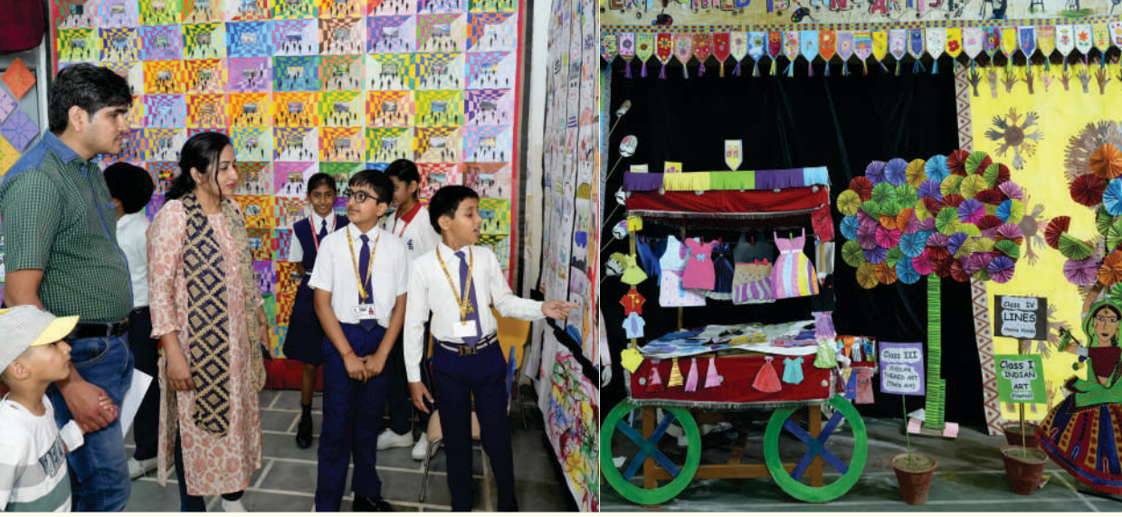
A glimpse into the bright minds of tomorrow - Primary Exhibition