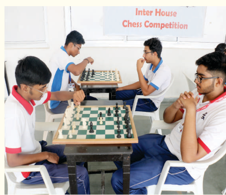
Inter-House Chess Tournament (Seniors)