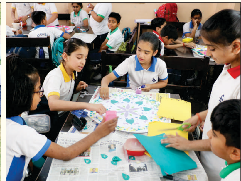
Intra-Class Paper Rangoli Competition