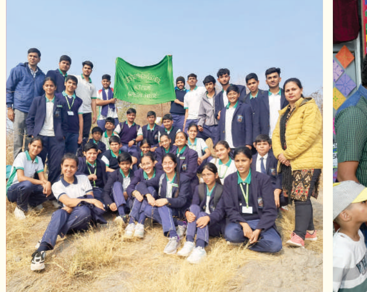
Hiking Adventures (Seniors)