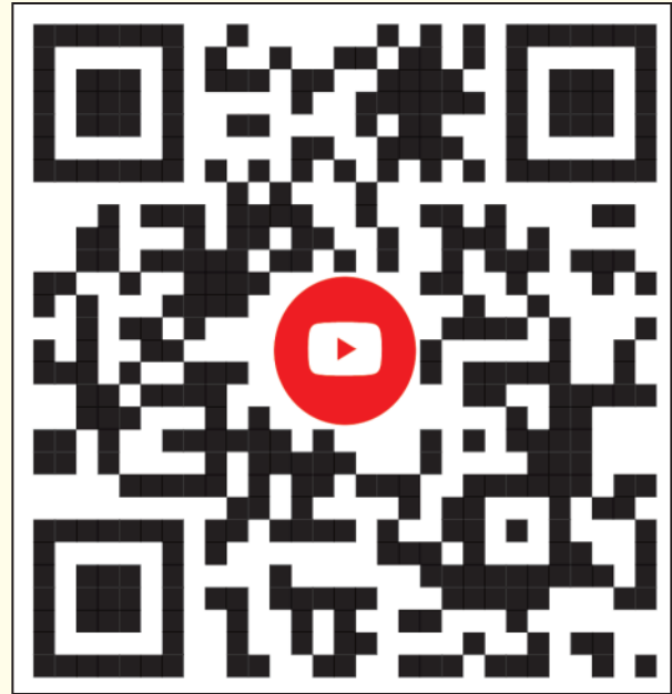
School YouTube Channel