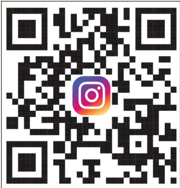
School Instagram Account